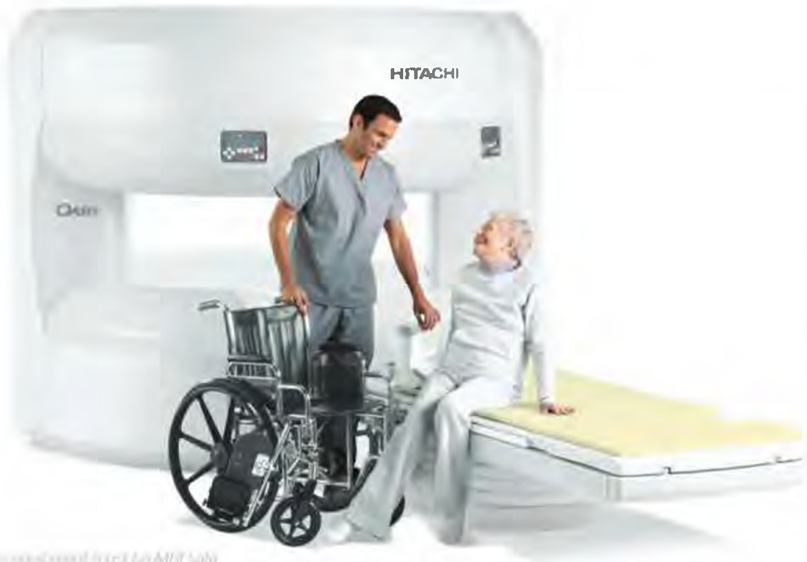
Hitachi Oasis 32" wide table lowers to 20" for easy patient access and offers 3 axis power driven lateral movement at iso-center.